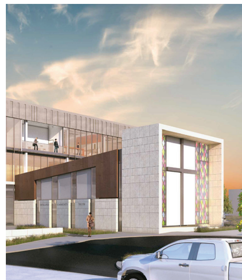
View of the chapel from Barnett Avenue