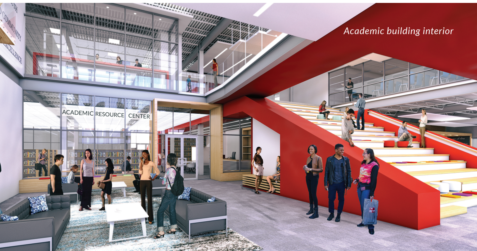
Academic building interior