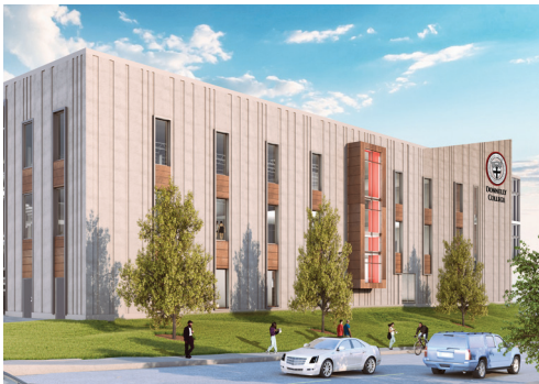
Academic building – future

With the guidance of Donnelly's President, the Building Committee and expert assistance from Burns & McDonnell and MC Realty, the Board of Directors approved a revised campus master plan in spring 2017. This plan called for renovating the final two floors in Donnelly's second academic building, Marian Hall, where our Practical Nursing and new Registered Nursing programs are now housed. It also called for replacing our main academic and administrative building (the former Providence Hospital building), rather than trying to accomplish challenging and expensive renovations. This bold plan will double our student capacity to 800 and give Donnelly an academic home designed specifically for the College for the first time in our 68-year history. (Donnelly's first location at 12th & Sandusky was the former home of Bishop Ward High School.)