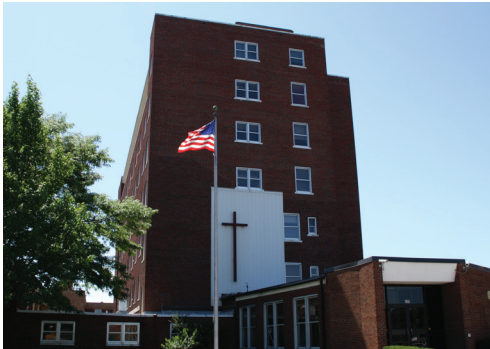
Academic building – present

The vision of Donnelly College is to advance the common good by being the most accessible and transformative Catholic college in the country.